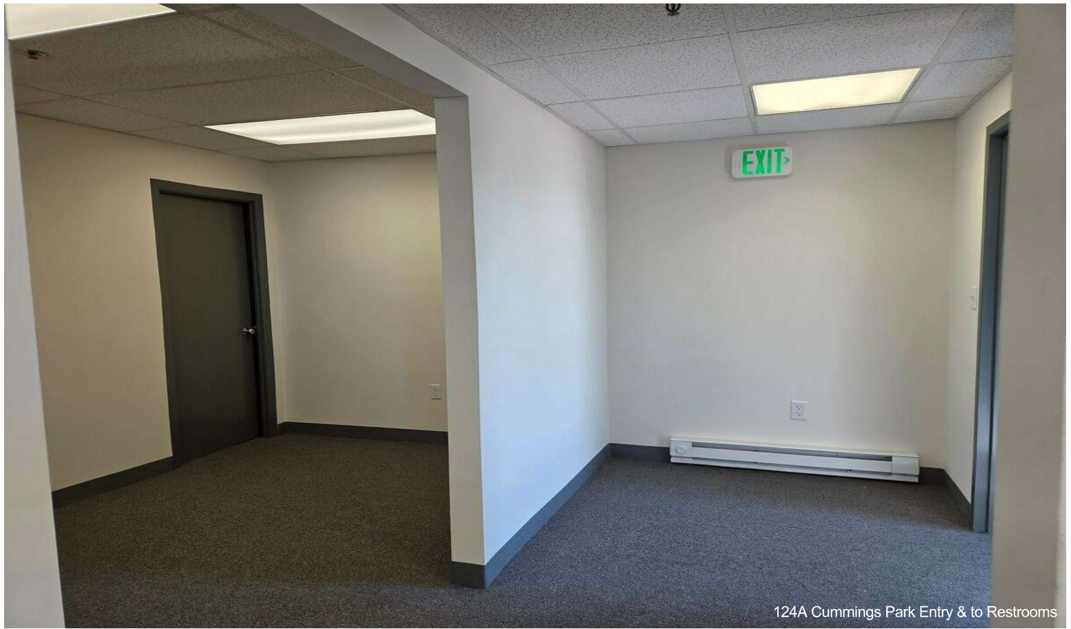
124A Cummings Park Entry & to Restrooms