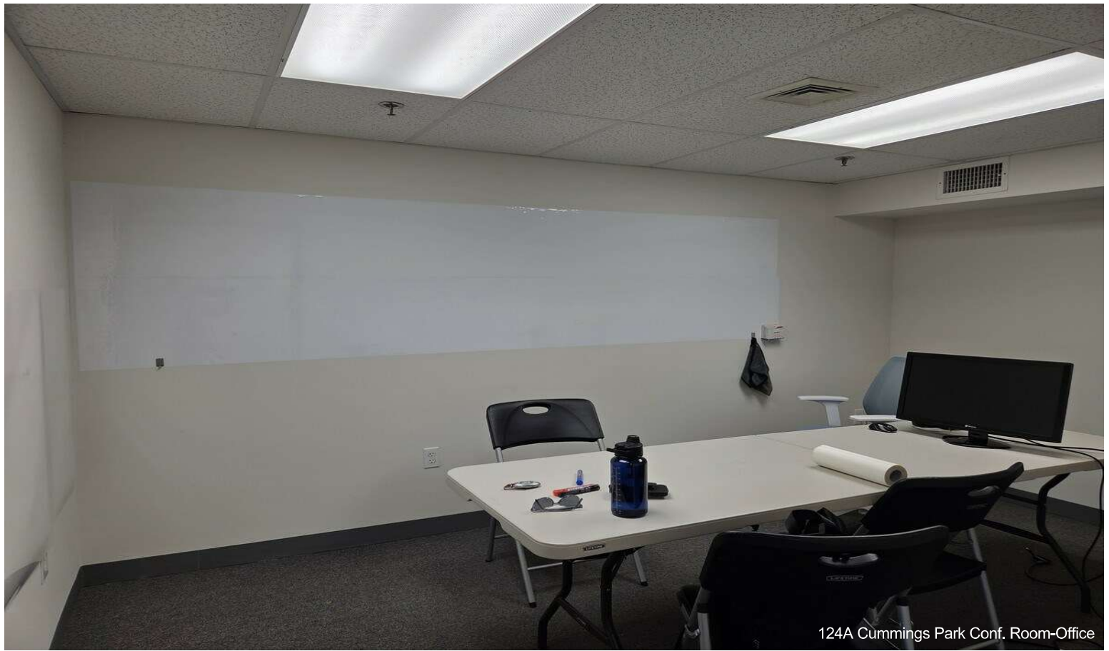
124A Cummings Park Conf. Room-Office