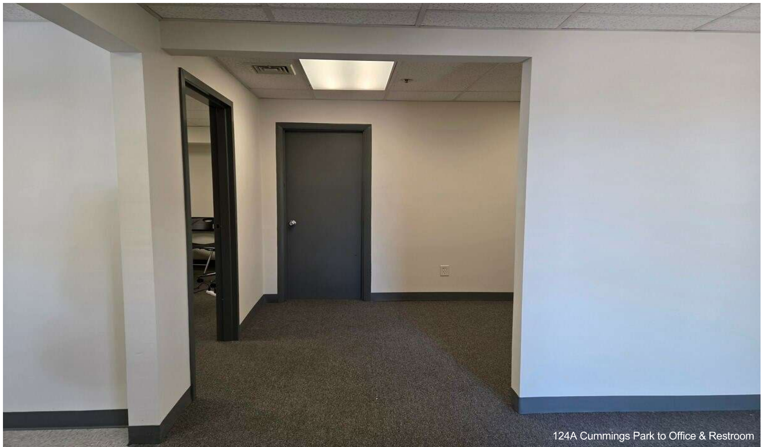
124A Cummings Park to Office & Restroom