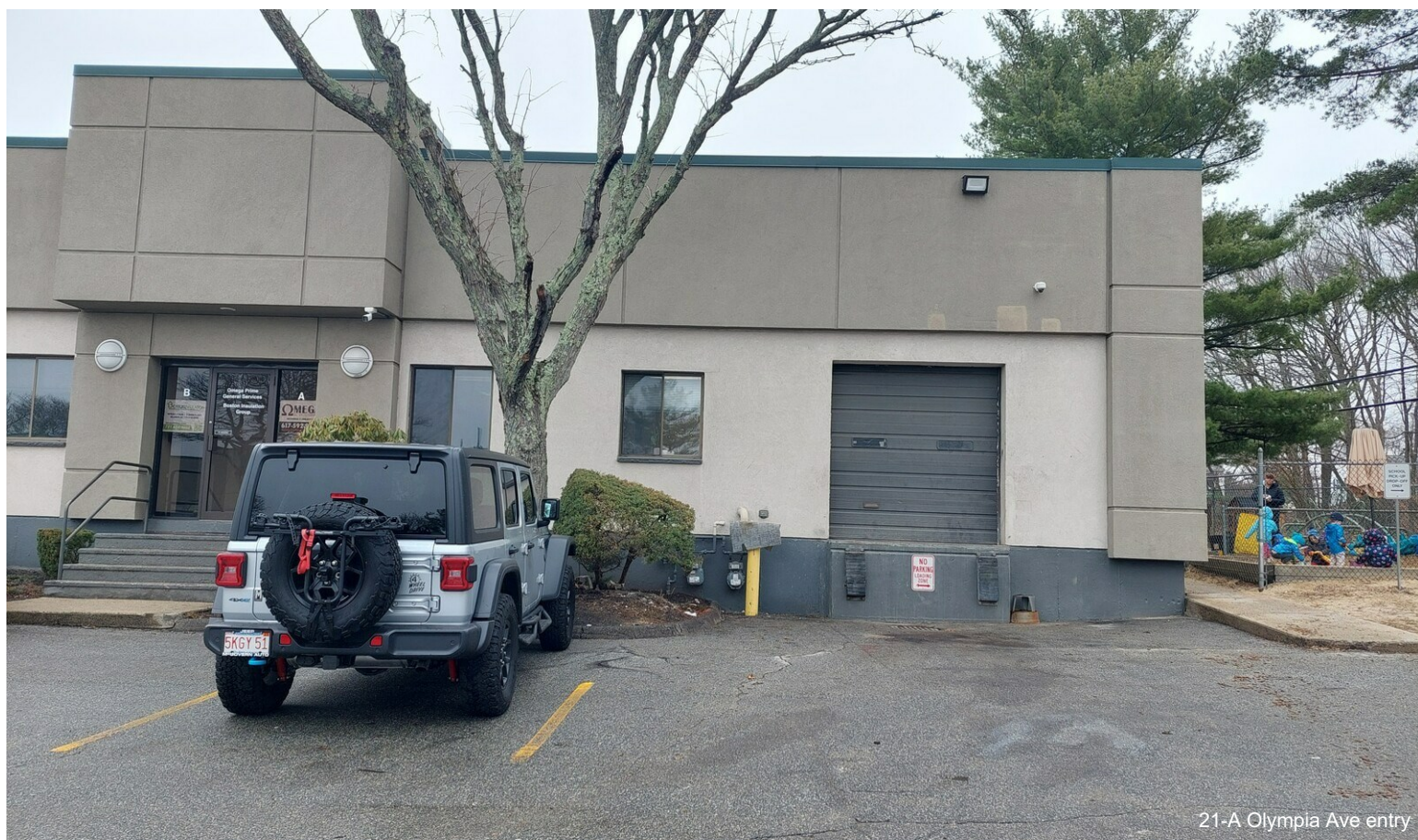
21-A Olympia Ave entry