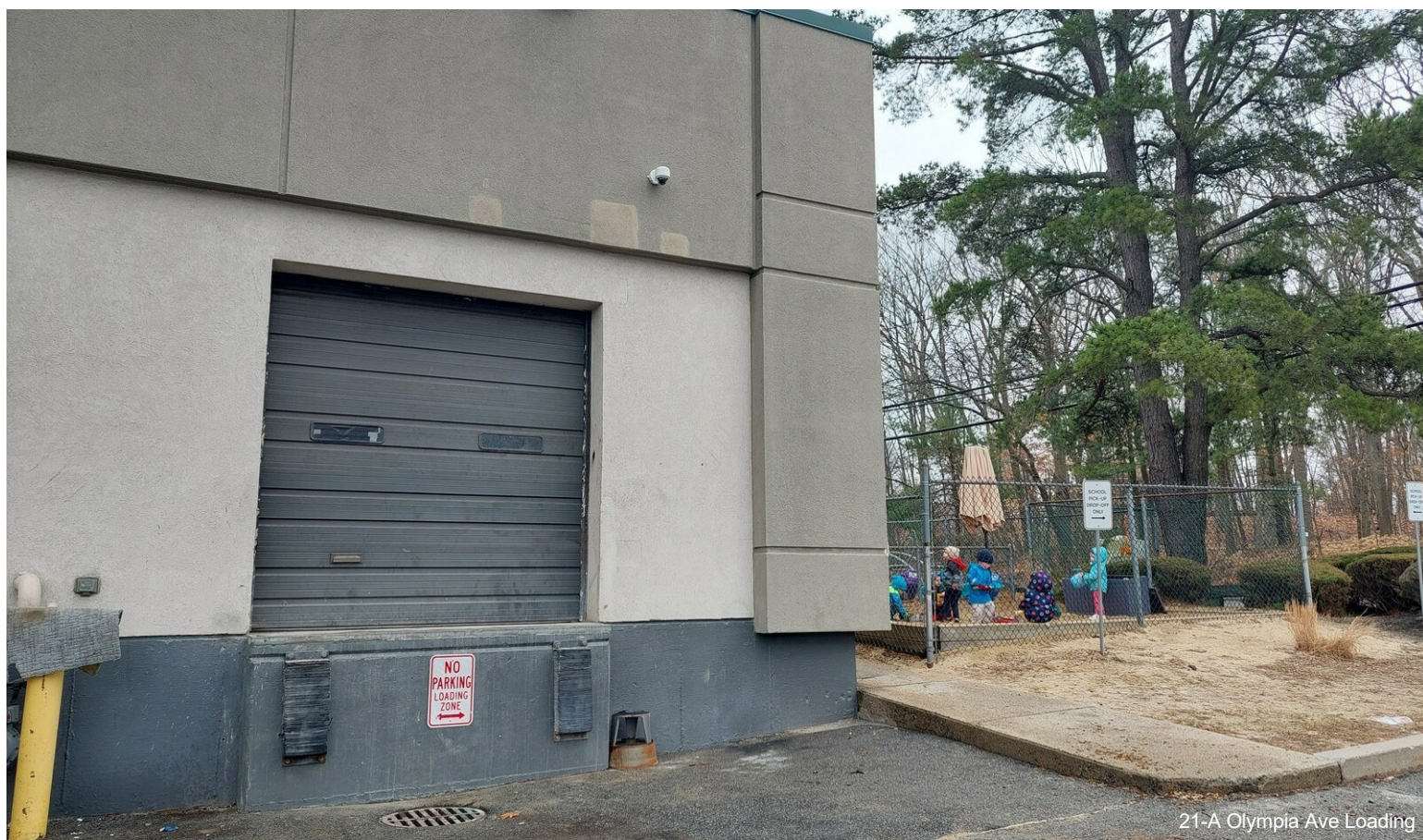
21-A Olympia Ave Loading