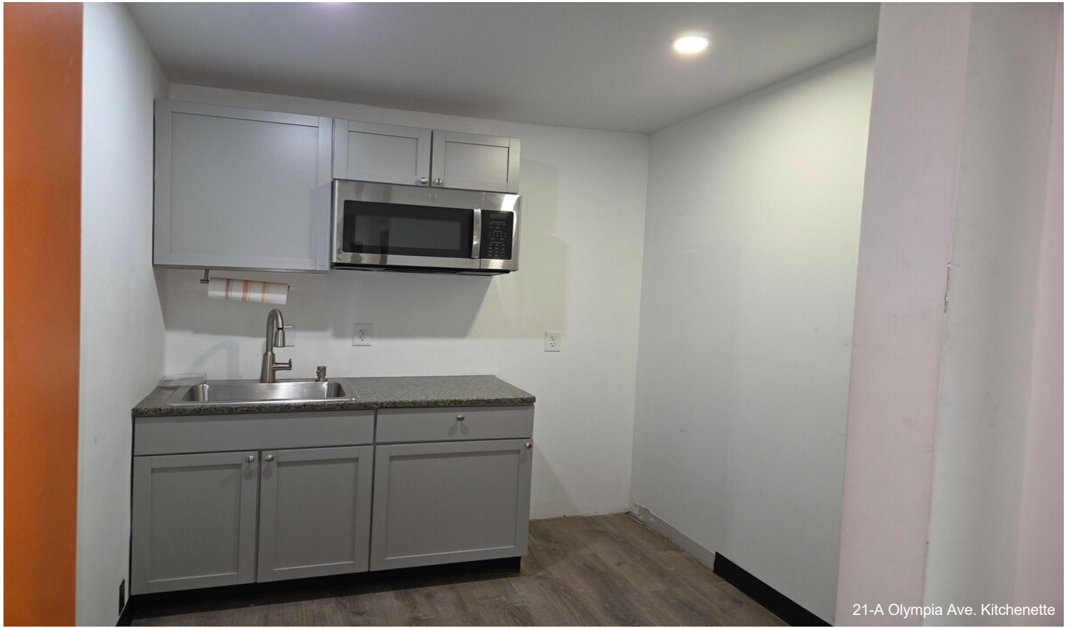
21-A Olympia Ave. Kitchenette