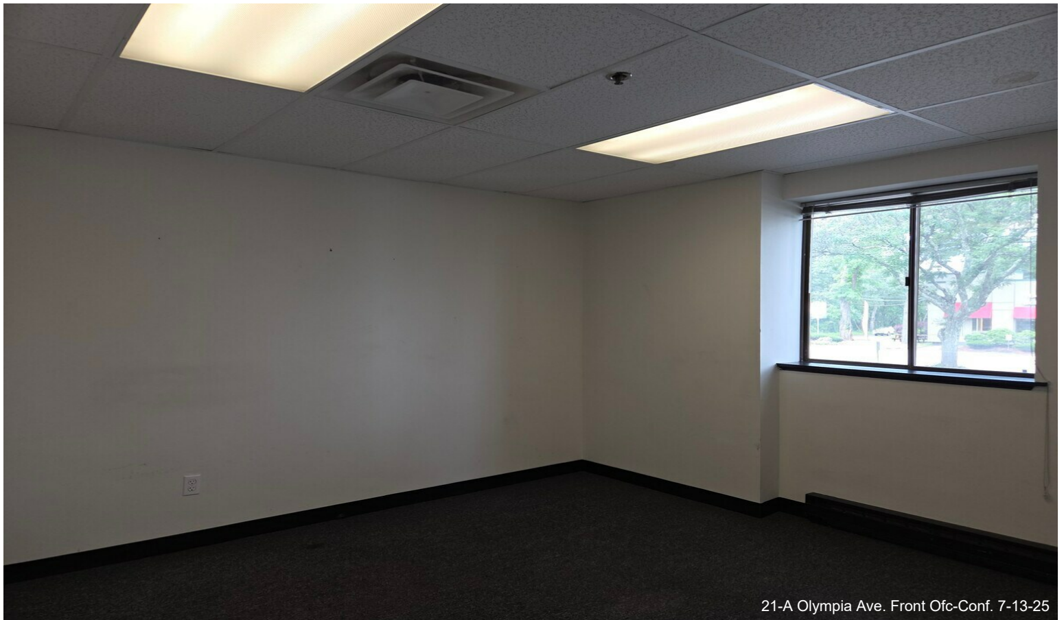
21-A Olympia Ave. Front Ofc-Conf. 7-13-25