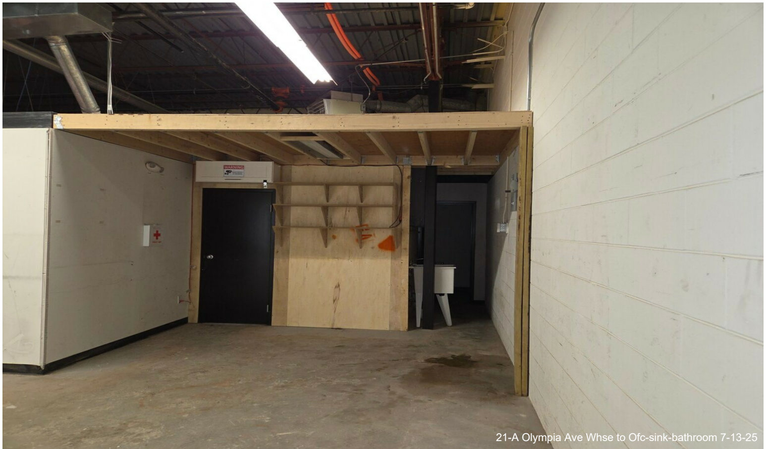
21-A Olympia Ave Whse to Ofc-sink-bathroom 7-13-25