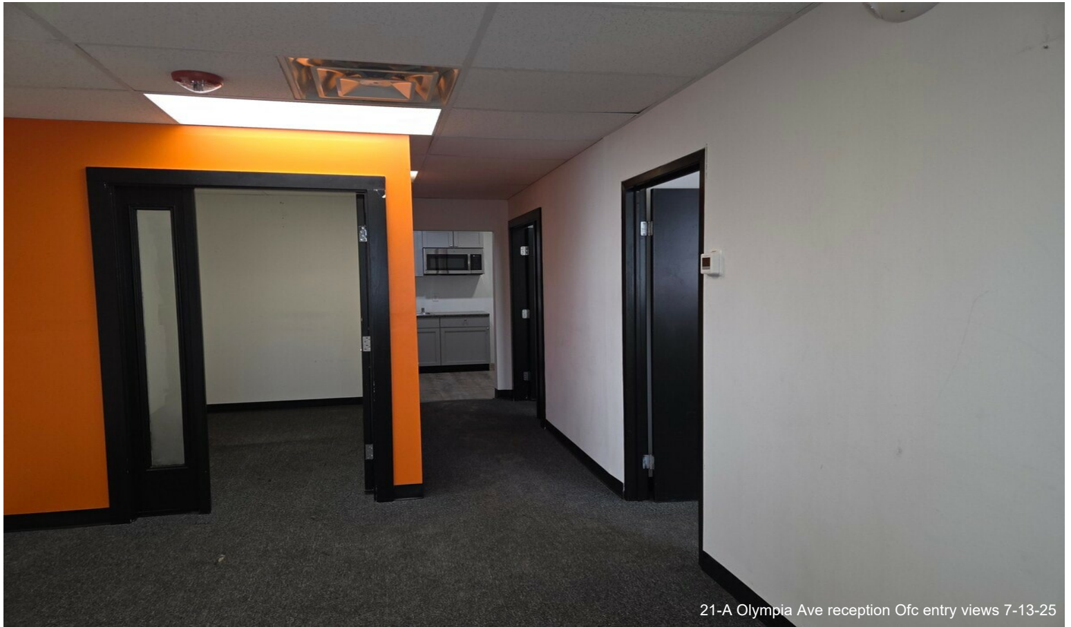
21-A Olympia Ave reception Ofc entry views 7-13-25