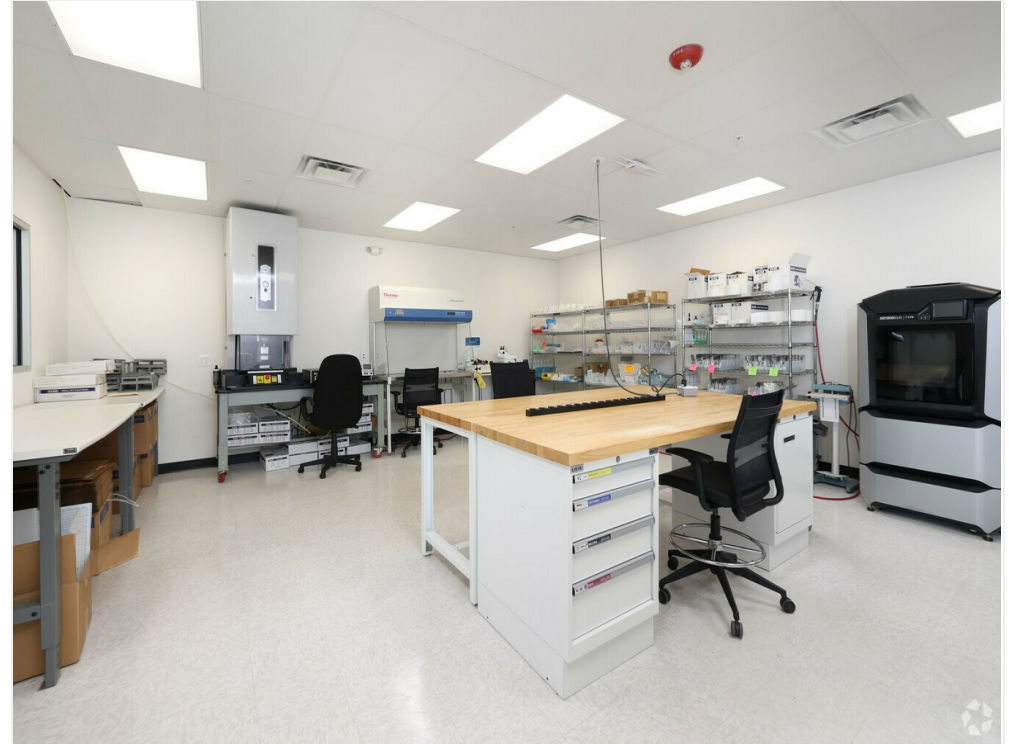
Suite 4550 Lab 4