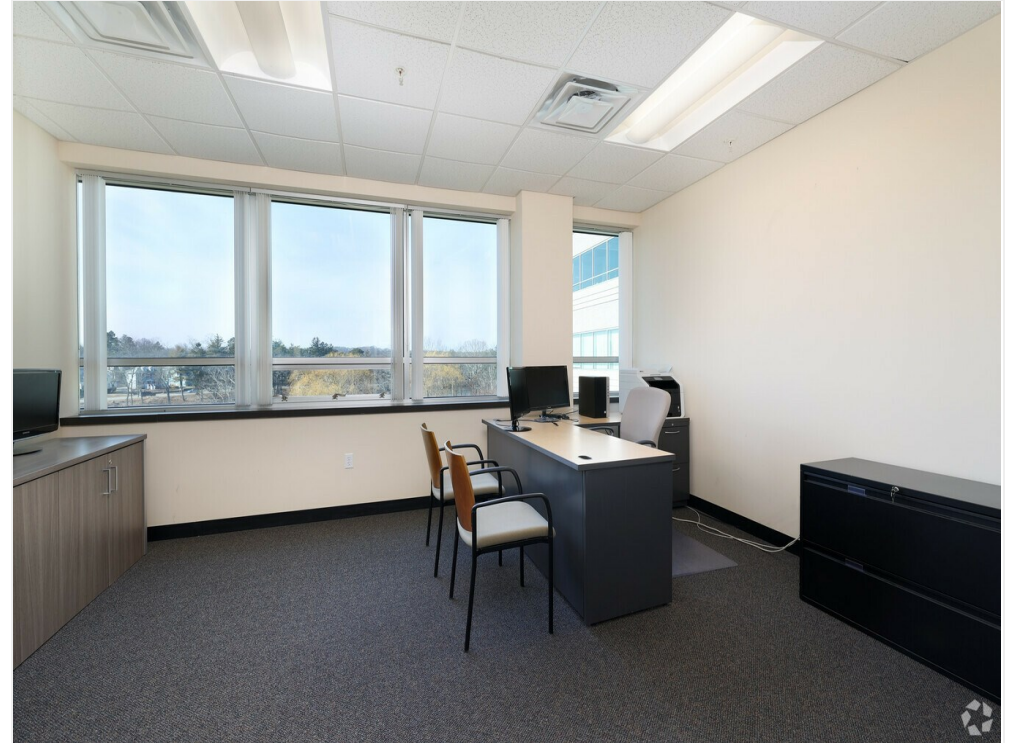
Suite 4550 Office