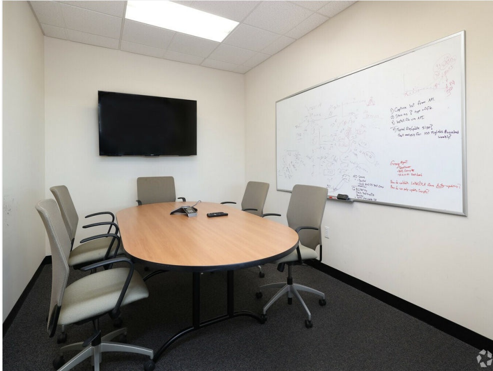
Suite 4550 Small Conference Room