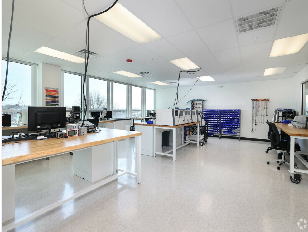
Suite 4550 Lab 1