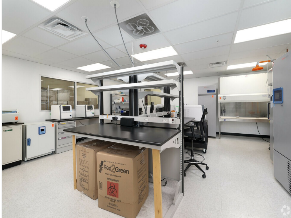
Suite 4550 Lab 3