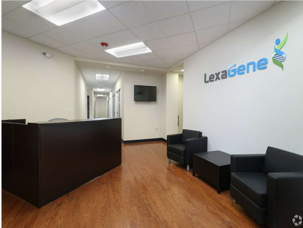
Suite 4550 Lobby