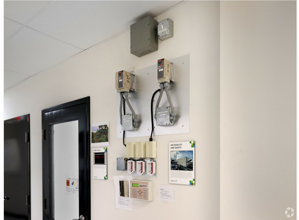
Suite 4550 Air Quality