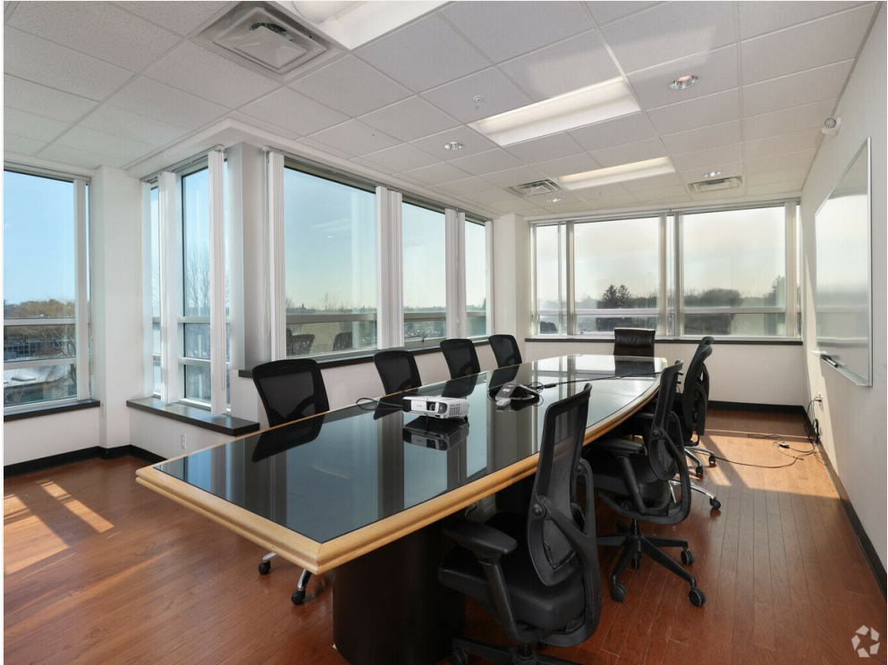
Suite 4550 Large Conference Room