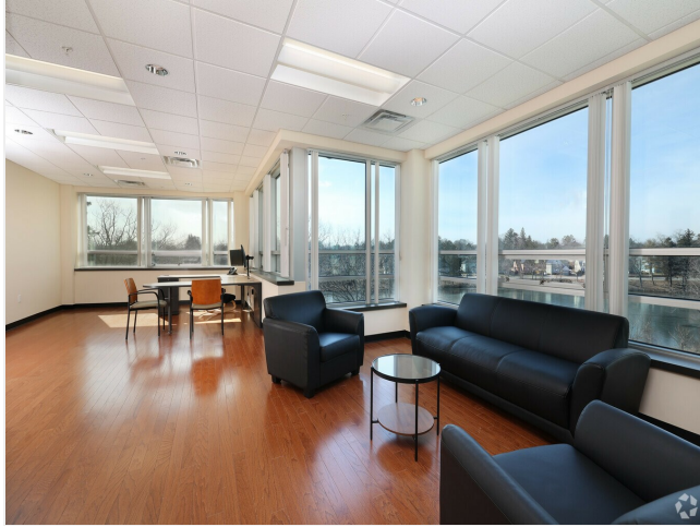
Suite 4550 Executive Office