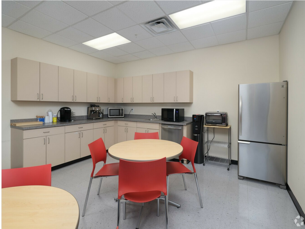
Suite 4550 Kitchen