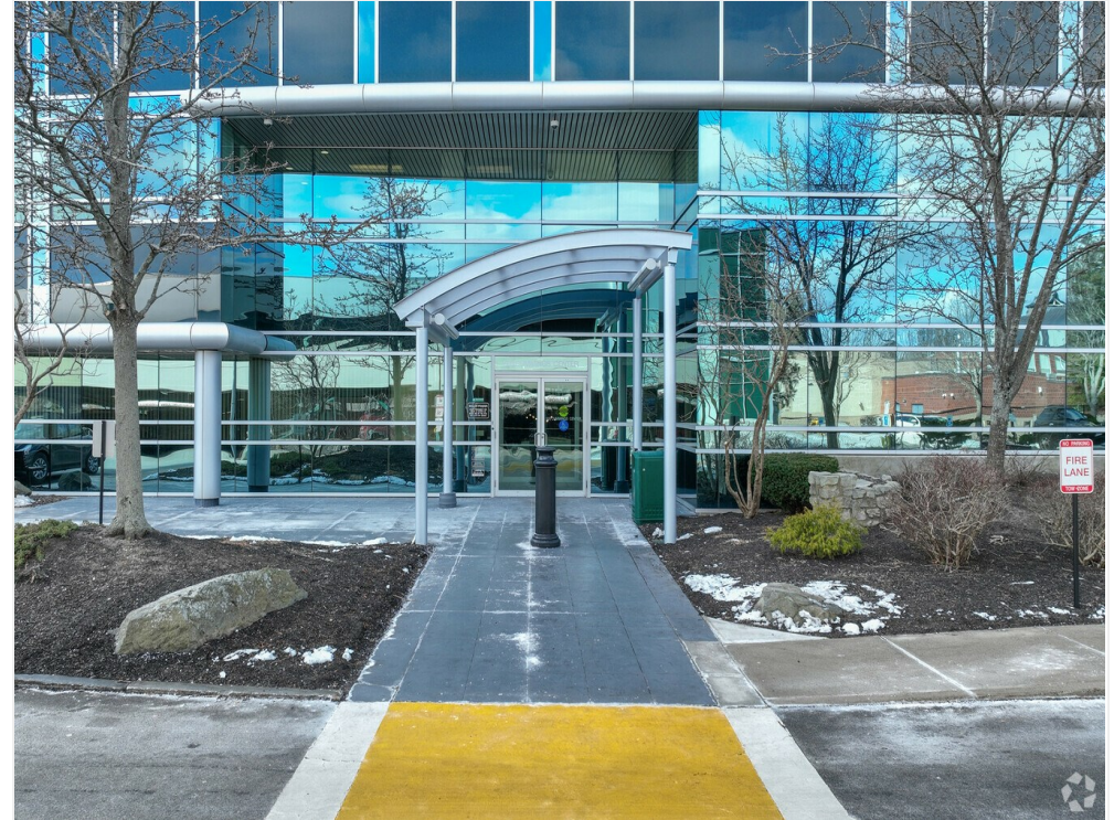
Entrance & Walkway to Garage