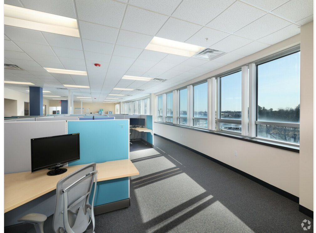
Suite 4550 Workstations